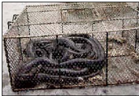
Longhufeng is a famous local dish in Guangdong, made with snake, cat and chicken [ChinaDaily]

[John Nash, from A Beautiful Mind ©2001 Universal Studios and DreamWorks LLC]