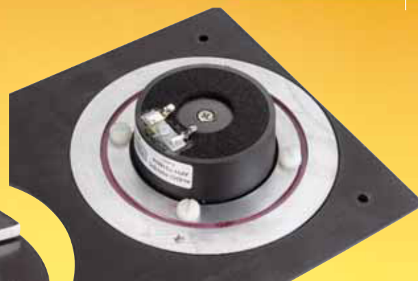
The "Hyper Holographic Cone Tweeter" contains a double basket system made of metal and plastic (see the cutaway model on the left). It is specially attached and decoupled (see above).

of the connection terminal and the tweeter. In fact, it doesn't get more direct and low-loss than this. Only a couple of resistors placed directly on the driver and used for level adjustment remain in the signal path.